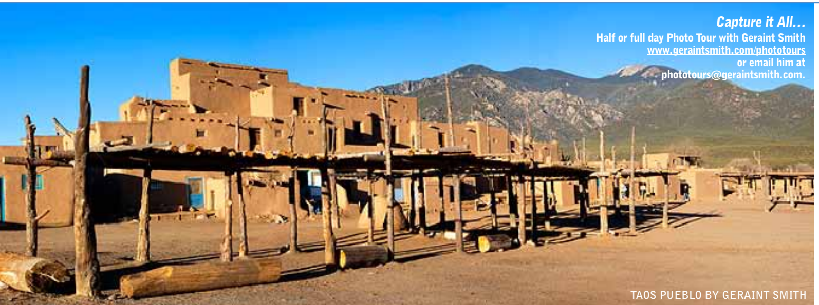
TAOS PUEBLO BY GERAINT SMITH

Half or full day Photo Tour with Geraint Smith www.geraintsmith.com/phototours or email him at phototours@geraintsmith.com .