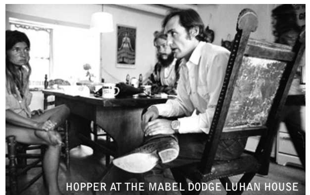
HOPPER AT THE MABEL DODGE LUHAN HOUSE