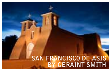
SAN FRANCISCO DE ASIS

It is only fitting that the home built by the doyenne of Taos' artistic movement would later be owned by actor/director Dennis Hopper. After directing Easy Rider , the movie that made him a star, Hopper was so taken with the Taos scenery and lifestyle that he spent another ten years living and working at this iconic local landmark after the film was completed. That era – and Hopper – brought a whole new set of stars to Taos, including Timothy Leary, Jack Nicholson, Dean Stockwell, Harry Dean Stanton and Janis Joplin, who made the Taos scene very hip. In 1988 the house also served as the backdrop in the hit film Twins , starring Arnold Schwarzenegger and Danny de Vito. (Call ahead and plan on one hour for a tour)