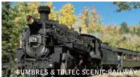
CUMBRES & TOLTEC SCENIC RAILWAY

Cumbres & Toltec Scenic Railway , departing out of Antonito, CO and Chama, NM www.cumbrestoltec.com or call 1-888-CUMBRES. This little narrow gauge remnant of New Mexico's Western past boasts one of the most filmed stretches of southwest back country. Either route gives breathtaking – and different – views that simply delight filmmakers. First there are the authentically restored trains themselves that have frequently served as movie sets. And then the open valleys and trestles, followed by the jaw-dropping canyon vistas and clear mountain air. No wonder 1969's Butch Cassidy and the Sundance Kid , directed by George Roy Hill;