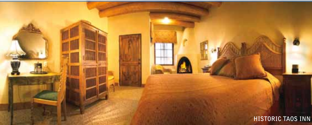
HISTORIC TAOS INN