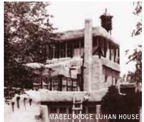
MABEL DODGE LUHAN HOUSE

90th Anniversary of the completion of Mabel's house (February 25)