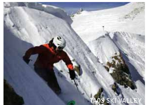
TAOS SKI VALLEY

Use your smartphone to log on to www.TAOS.org and you'll automatically have access to our mobile website.