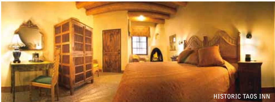
HISTORIC TAOS INN

Mabel Dodge Luhan House www.mabeldodgeluhan.com 240 Morada Lane, 800.846.2235 Hacienda del Sol www.taoshaciendadelosol.com 109 Mabel Dodge Lane, 575.758.0287 Historic Taos Inn www.taosinn.com 125 Paseo del Pueblo Norte, 575.758.2233 For additional Hotels visit www.taos.org/hotel-search