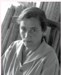
AGNES MARTIN, ABSTRACT EXPRESSIONIST/ MINIMALIST: