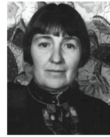
MABEL DODGE LUHAN

Among the many places and luminaries Mable Dodge Luhan touched