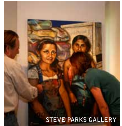
STEVE PARKS GALLERY