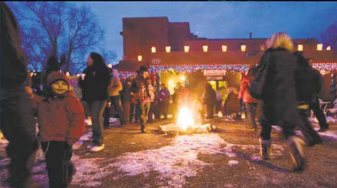
HOLIDAY LIGHTING ON TAOS PLAZA