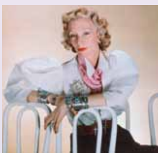
NOTED SOCIALITE, PHILANTHROPIST AND ARTIST-COLLECTOR, STANDARD OIL HEIRESS MILLICENT ROGERS:

Her seminal and unabashed style was a lifelong trademark; no matter what Millicent did or where she traveled, she wholeheartedly explored and adapted to the culture in which she lived, from New York to Austria to Taos. Beginning in 1947 at her beloved Turtle Walk home in Taos (now a private residence for one of her sons) she began lovingly amassing her collections of Spanish Colonial furniture, Native American textiles and jewelry, baskets, Santos, tinwork and paintings as well as the most extensive collection of Maria Martinez pottery extant. She also created original