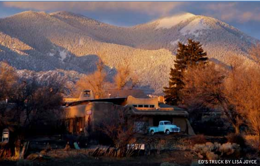
ED'S TRUCK BY LISA JOYCE

Tour the Mabel Dodge Luhan House >> The Women Artists of Early Taos Exhibit >> Cultural Threads—the Colcha Revival >> Tour Agnes Martin's Former Studio