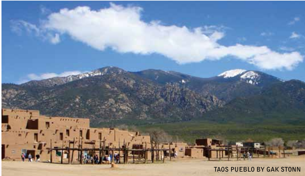
TAOS PUEBLO BY GAK STONN